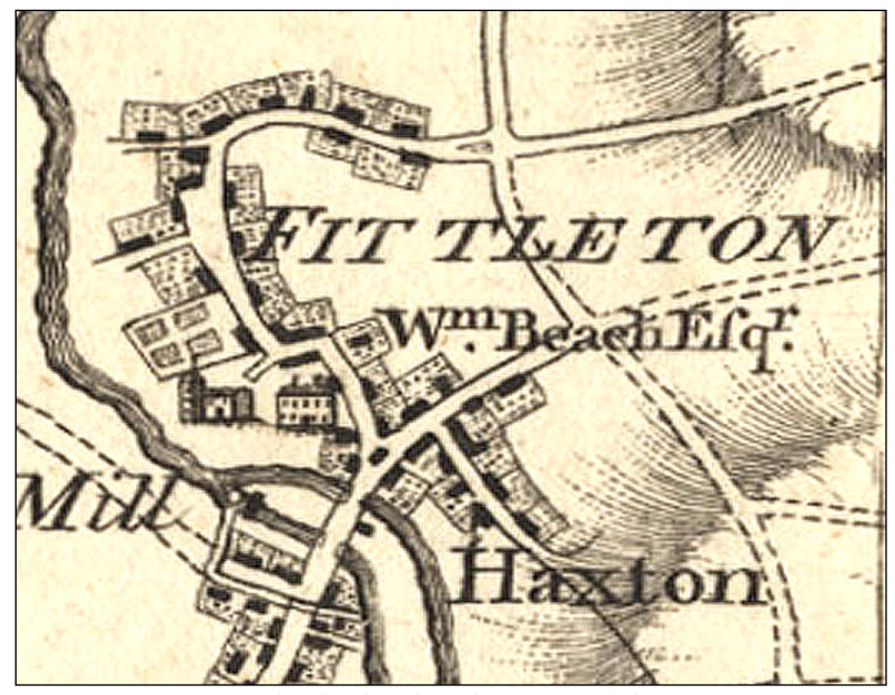
-Map showing location of Haxton to Fittleton.

Initially, the Batt family may have moved from Wiltshire to Hoe-Benham, Berkshire, 53 about 4.5 miles north of Newbury.54