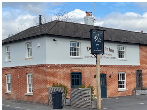
Start and finish at the Dog & Gun Inn on the A345